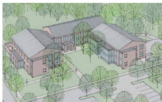
The outside of the library