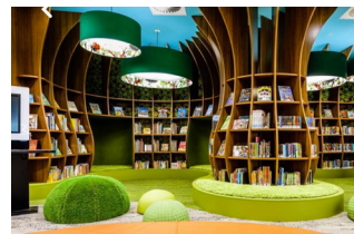
The children's section of the library